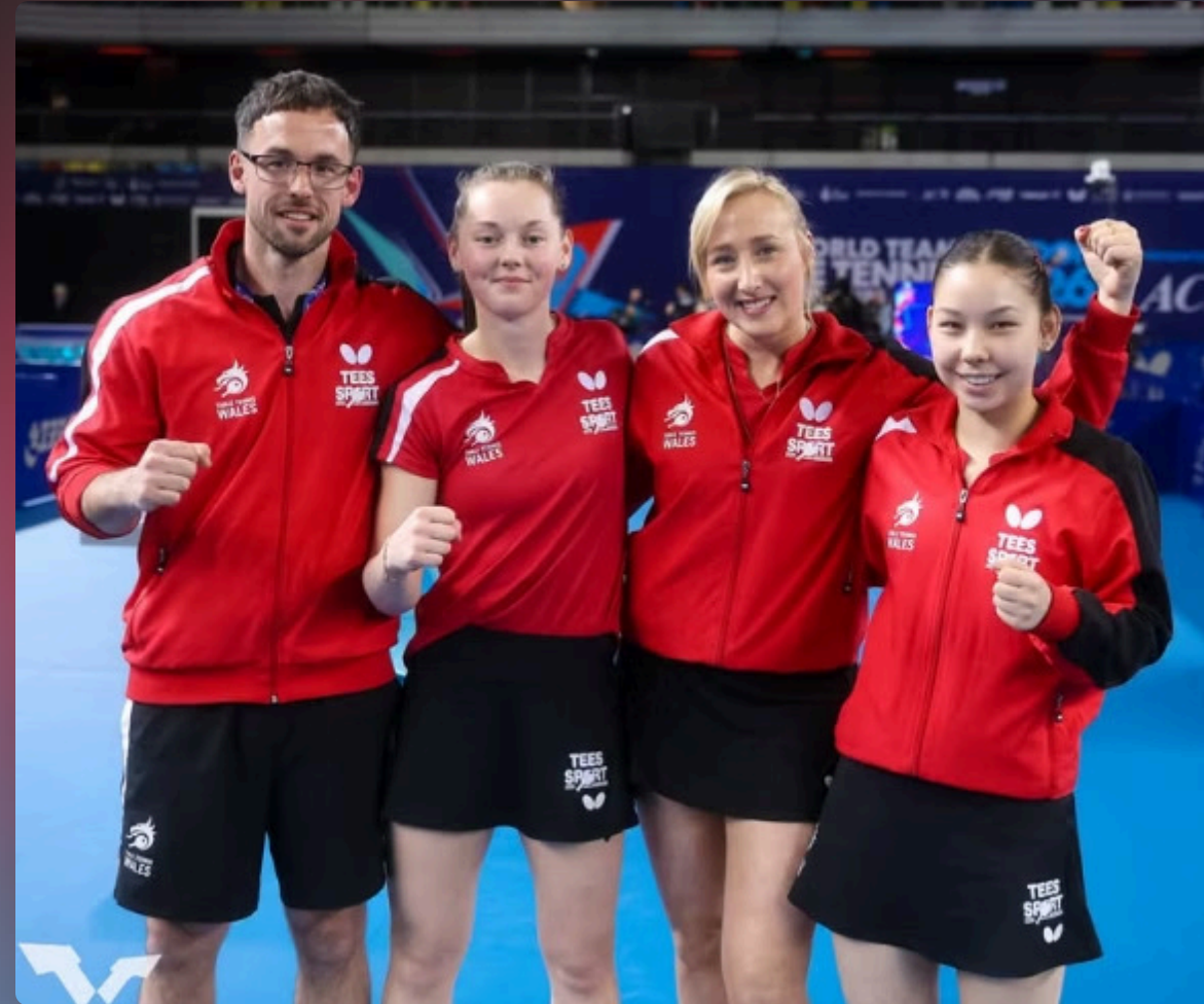
Table Tennis Wales believes that national success should create ripples throughout every community in the country. The Women & Girls Legacy Fund exists to turn that inspiration into tangible action – giving clubs, organisations, and communities the resources they need to welcome, retain, and celebrate women and girls in the sport.

The Welsh Women's Team has qualified for the World Championships – a landmark achievement that marks a defining moment for the sport in Wales. This milestone is more than a competitive result; it is a powerful platform to inspire the next generation.