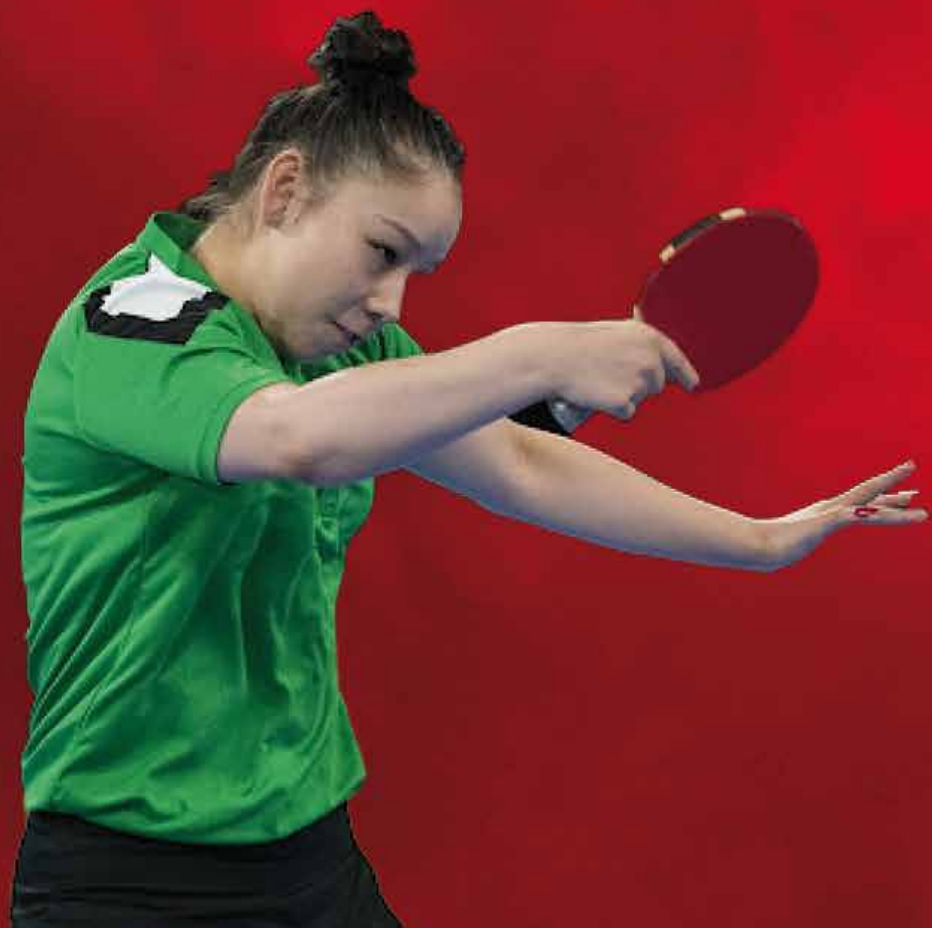
Table Tennis Wales Strategy 2022-2025